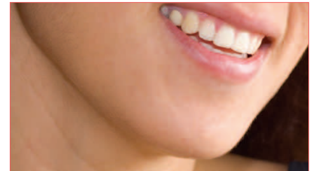
VelaSmooth can also tighten and improve the jaw line